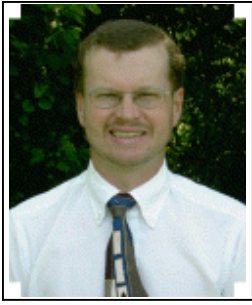
Greetings from Roye!