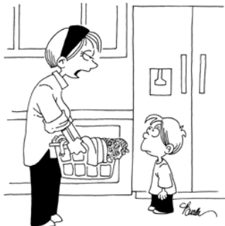
"Go outside and play, but stay out of the sandbox. You know what that does to your cell phone."